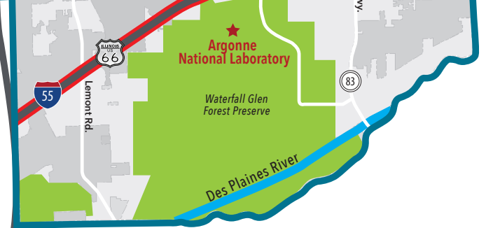
Community downtowns are listed on the community maps