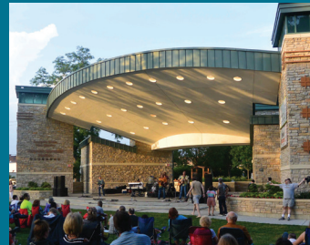
Concerts at Veteran's Memorial Pavilion