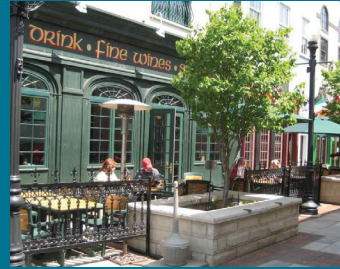
Downtown Downers Grove